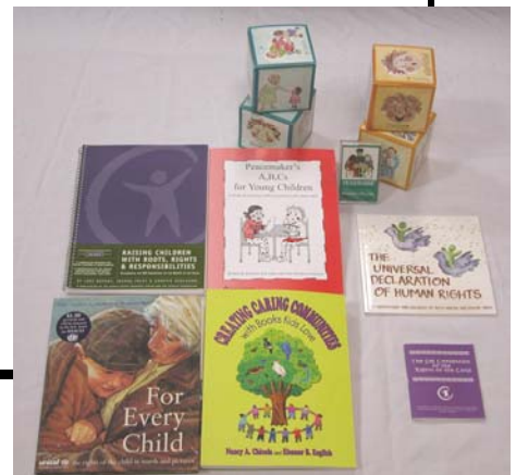
Item # 41570